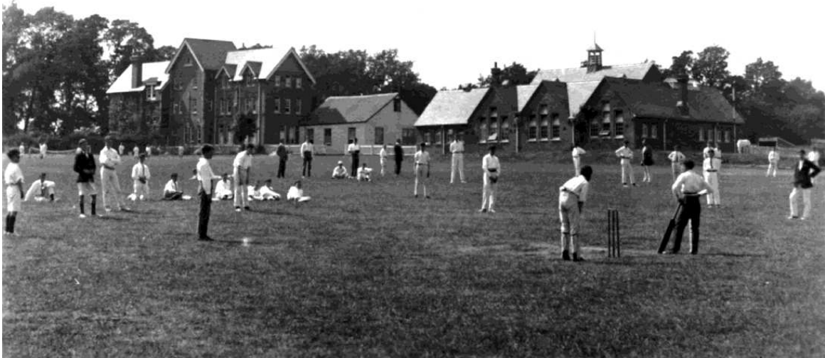
Cricket on the School field circa 1925

An altogether an outstanding decade for cricket. In the four years (1921 to 1924) the team played 42 games and lost a mere three of them.