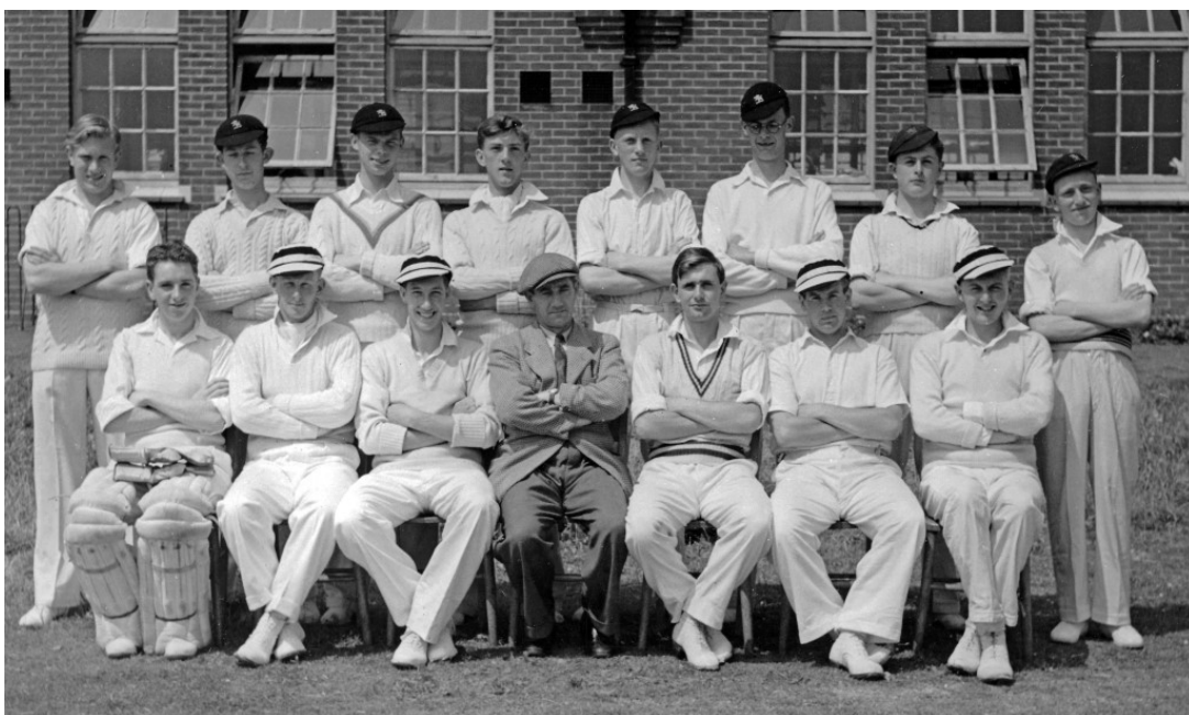
1 st XI Cricket 1951