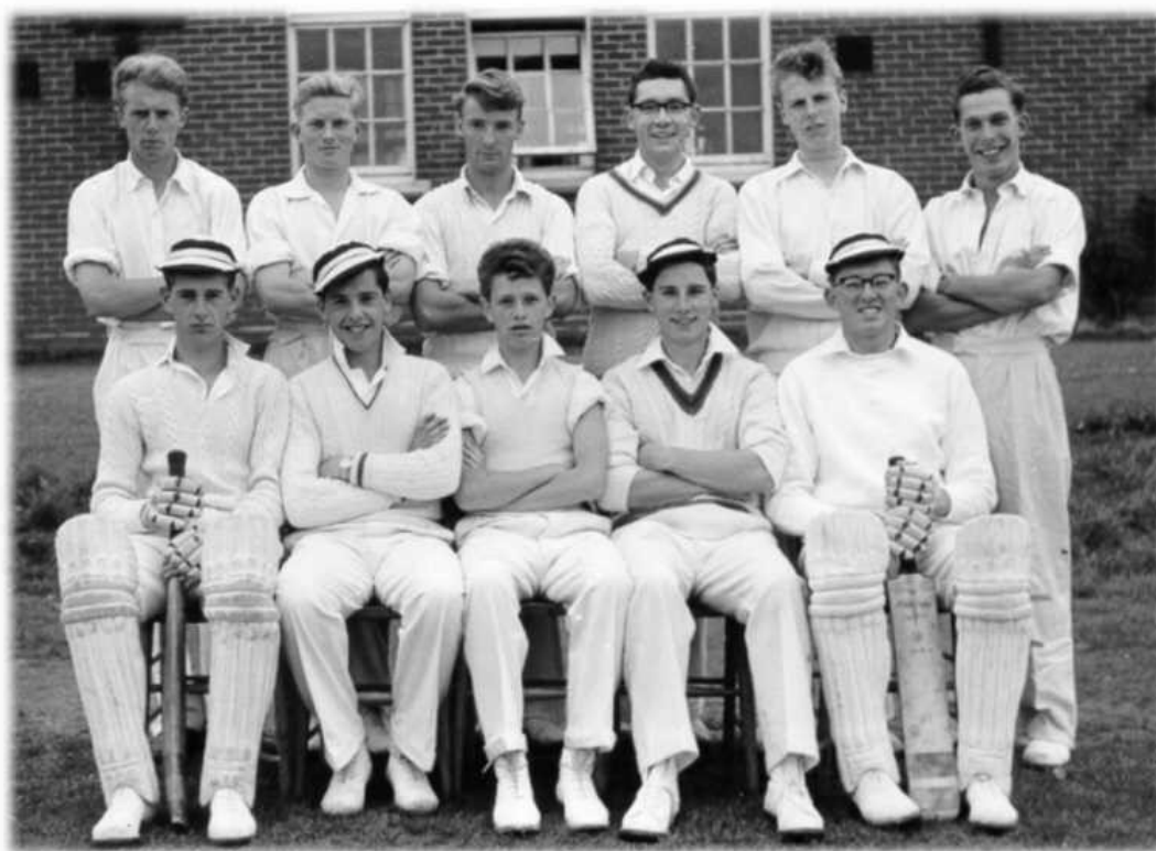
1 st XI Cricket 1957